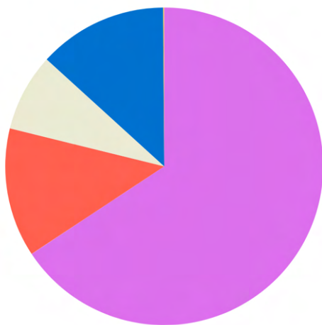
South Boston NDC Revenue 2023